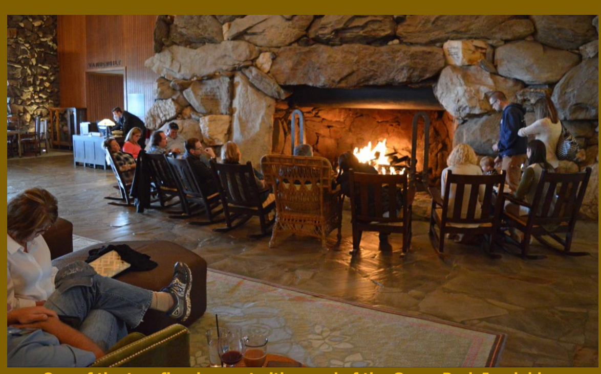
One of the two fireplaces at either end of the Grove Park Inn lobby.

He razed several of Asheville's TB sanitariums to clear sufficient land and built the walls five feet thick from granite boulders to keep it cool inside. The hundreds of rooms added in the late 20<sup>th</sup> Century are cooled by other means. Here's a video history: <a href="https://youtu.be/3xKDa1EKYyw">https://youtu.be/3xKDa1EKYyw</a>.