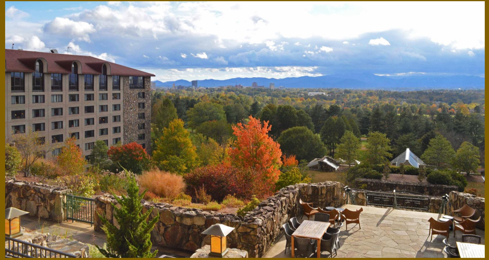
The view from the terrace of the Grove Park Inn is south across the city of Asheville and the French Broad River Valley to the Blue Ridge.