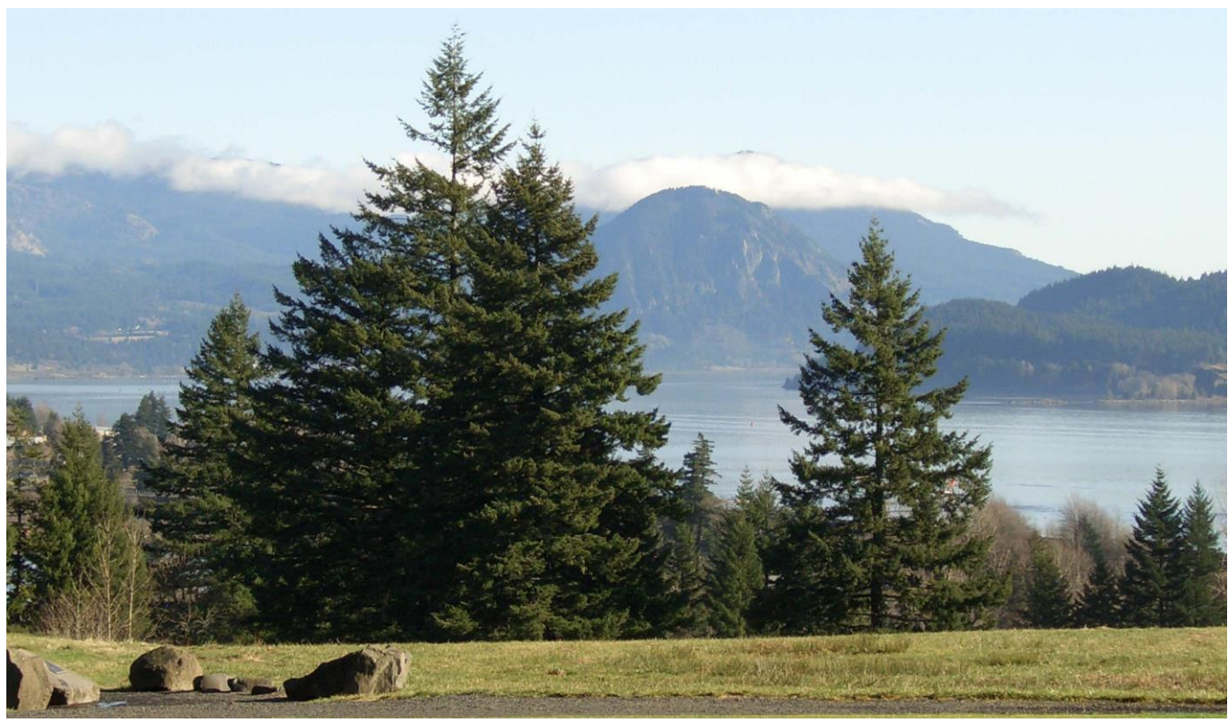
The Columbia River from the front lawn of our lodge on the north bank in Stevenson, Wash.

What happens when a glacier melts in Canada