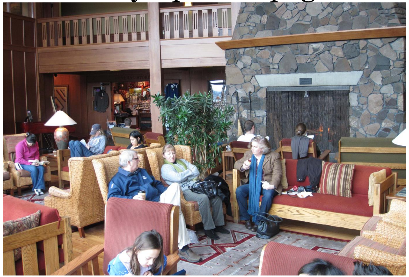
Inside the lobby of the Skamania Lodge