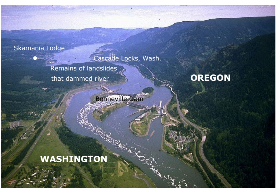
An aerial view from the internest looking upstream shows where the Columbia and the Cascades battle each other.

The water at the Columbia's Canadian source today fell as snowflakes thousands of years ago, turned to ice under the