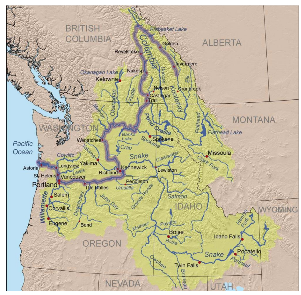
The Columbia River drains an area the size of France.