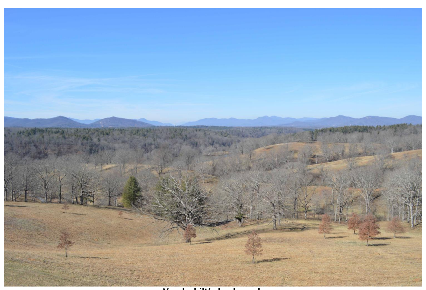
Vanderbilt's back yard.