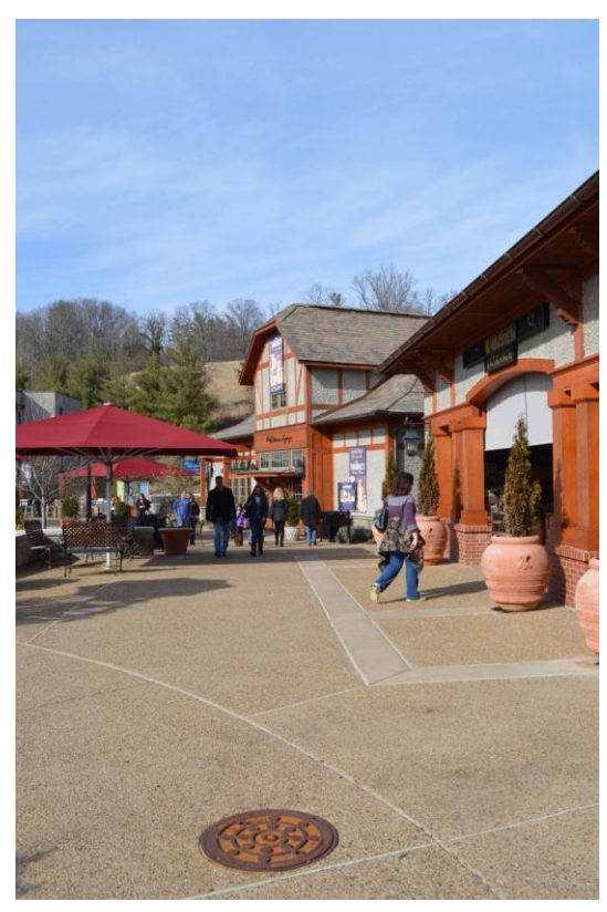
Parts of Antler Hill Village were once dairy buildings.

Muir was the preservationist, valuing nature for its spiritual qualities, the ethos of the National Park Service in the Department of Interior. Pinchot, at first an ally of Muir, was a conservationist who placed a commercial value on all natural resources and advocated managed, sustainable exploitation of them, the ethos of the National Forest Service in the Department of Agriculture.