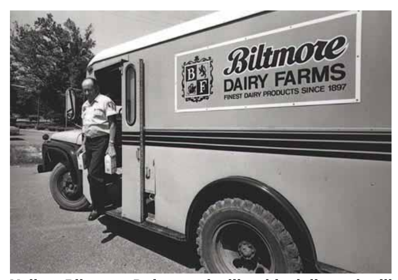
Yellow Biltmore Dairy trucks like this delivered milk to my house when I was growing up.