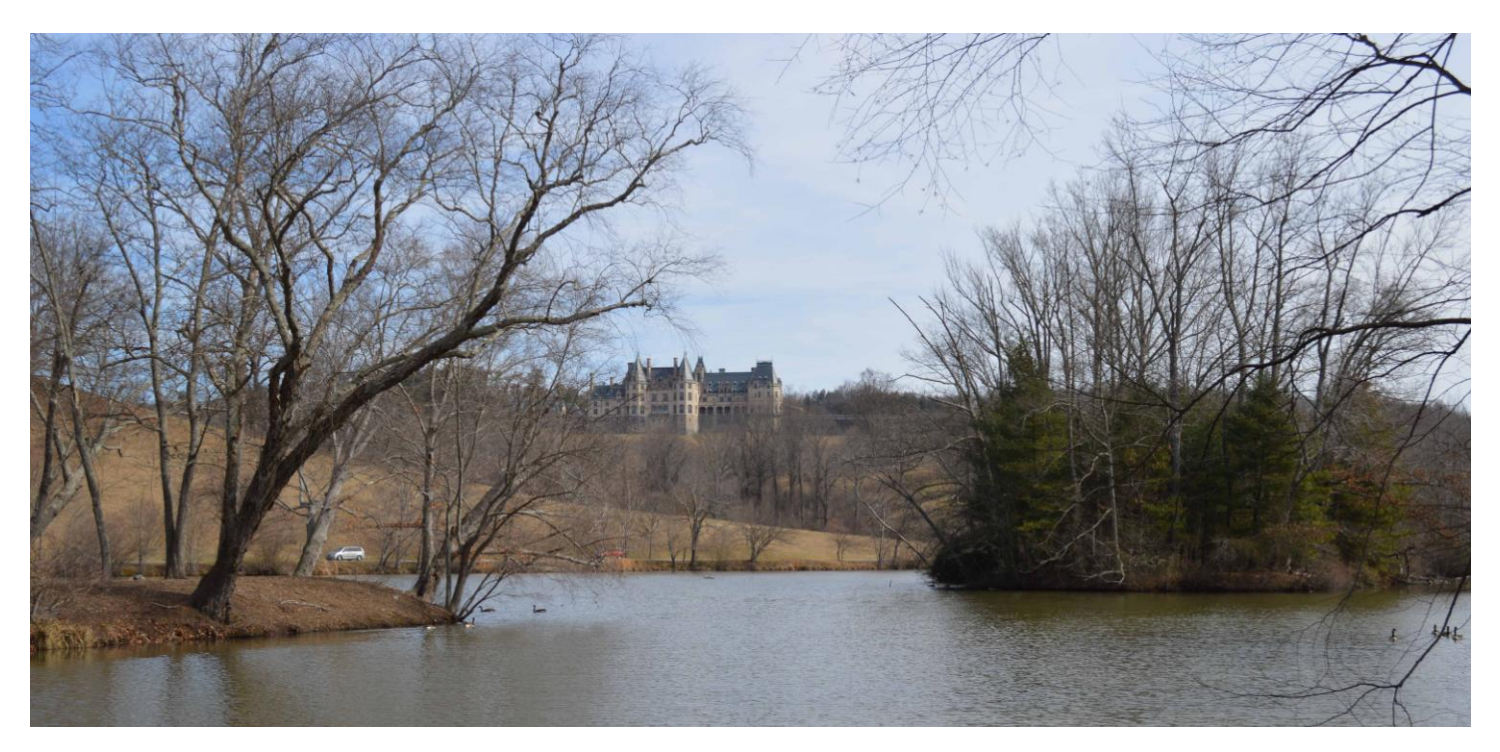
The Lagoon during our visit.