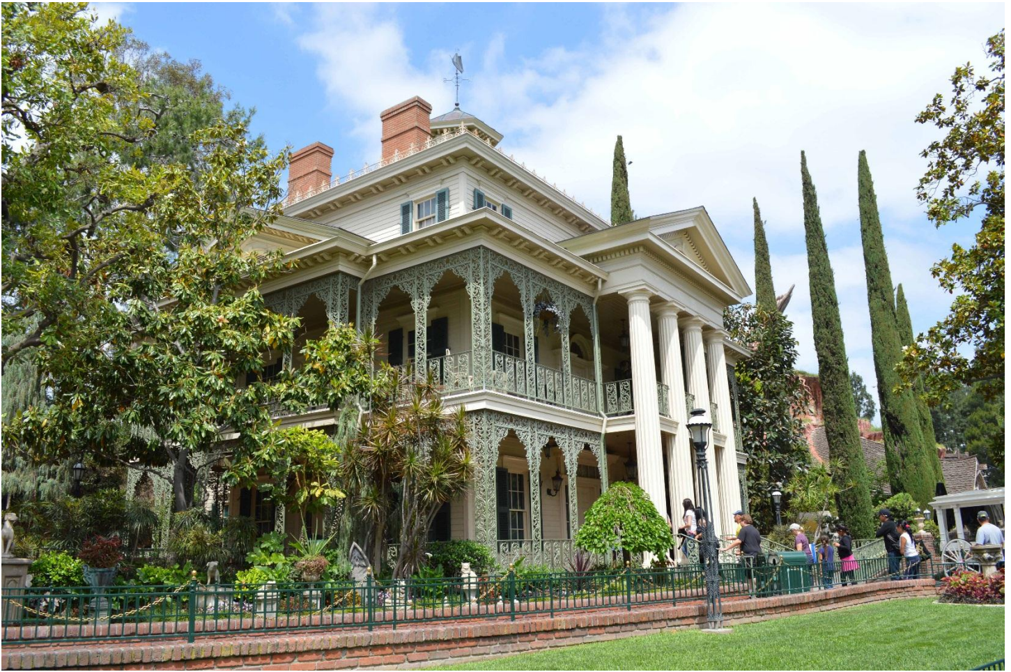
The Haunted Mansion in New Orleans Square, Magic Kingdom.