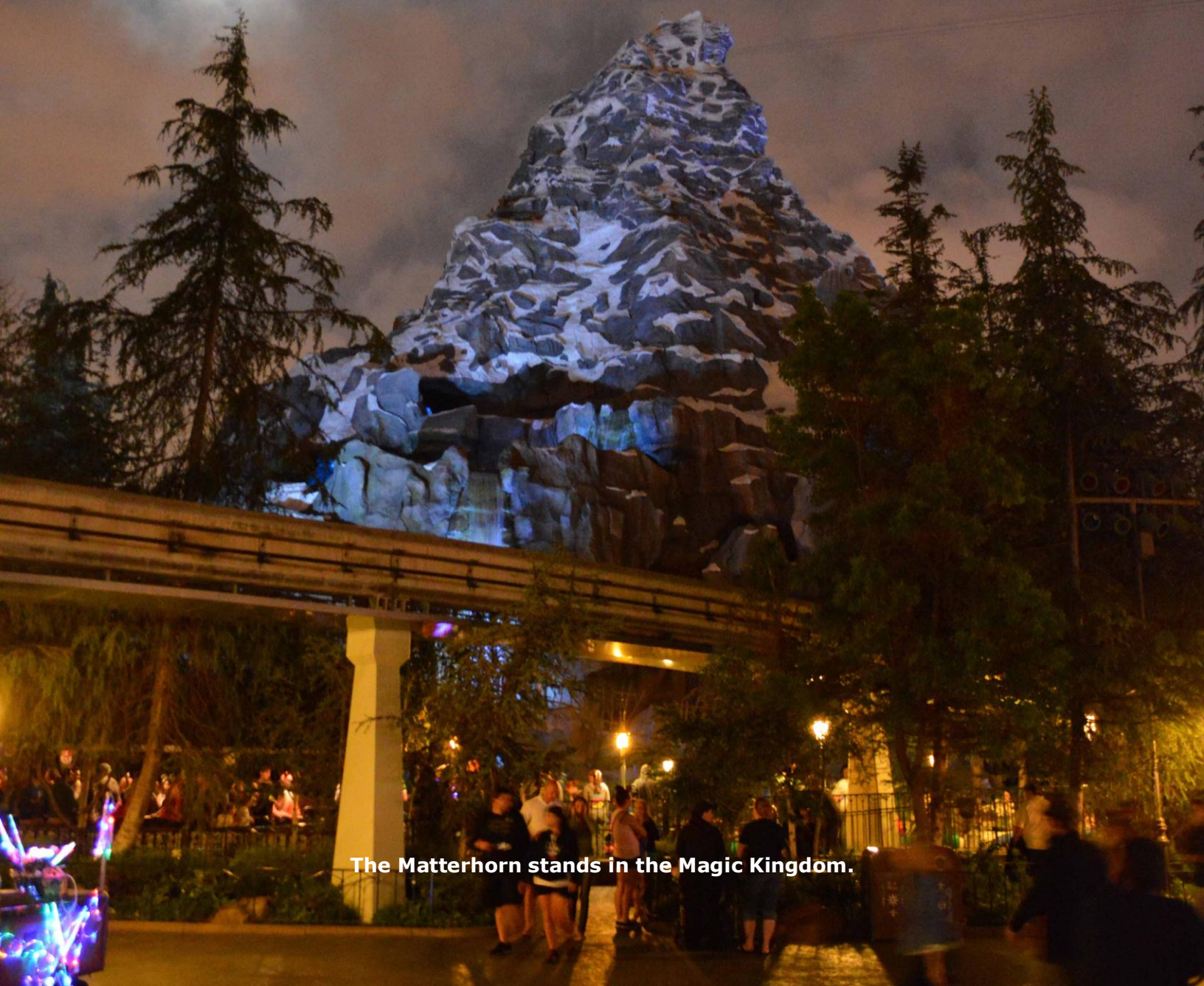
The Matterhorn stands in the Magic Kingdom.