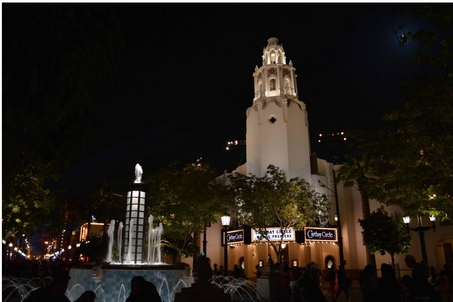
Outside the Carthay Circle Restaurant in the California Adventure Park.