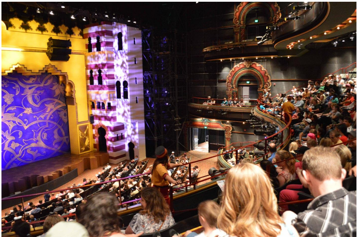
The crowd fills the 2,000 seat Hyperion Theatre, where we watched Aladdin .