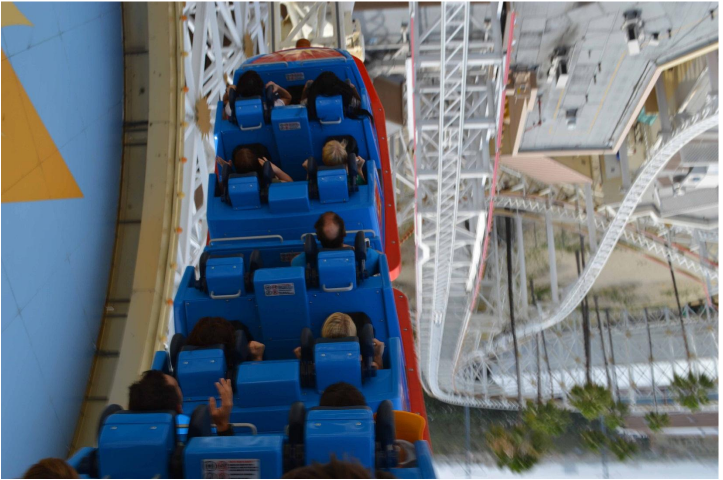
Upside down on the California Screamin' roller coaster.