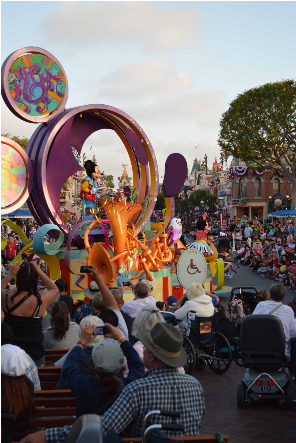
Mickey's afternoon parade turns down Main Street USA.