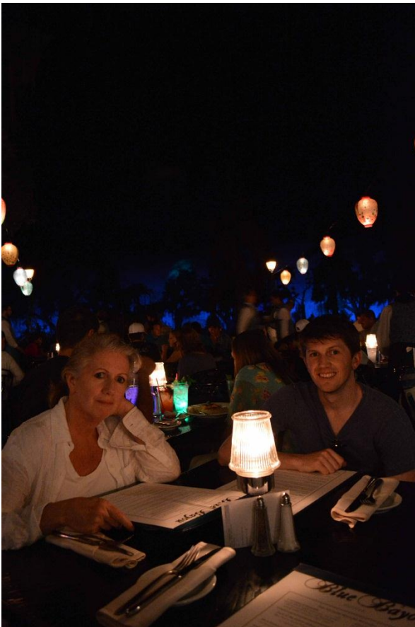
Dinner in the Blue Bayou Restaurant in New Orleans Square.